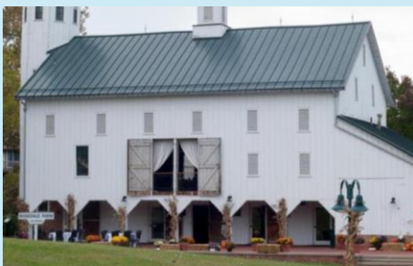
Historic Everal Barn Westerville OH

CO-OPP's 2022 Speed Buying Event is scheduled for October 3, 2022 and will host Businesses wishing to do business with public agencies. This event will again be held at the Historic Everal Barn in Westerville, Ohio.